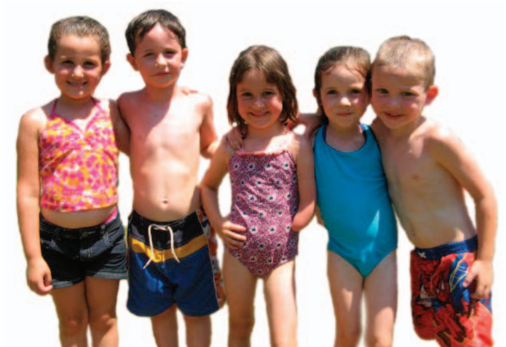
Friends at Camp Sargent